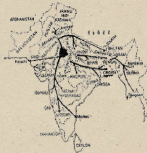
Migration of the Marwaris